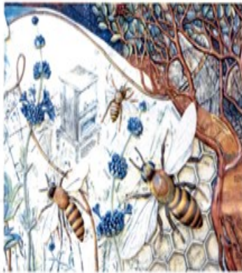
Exterior mural sculptures by Betsy K. Schultz