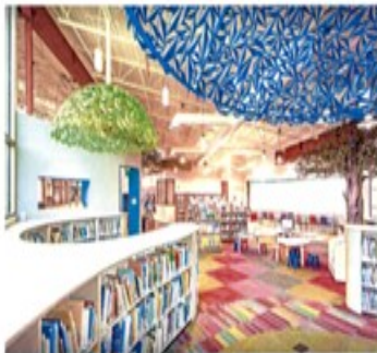
Children's area ceiling sculptures inspired by native Kumeyaay dwellings, by Christopher Puzio; replica native Live Oak trees by NatureMaker